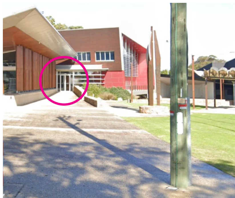
Entrance to Shire building/Authors & Presenters Green Room: